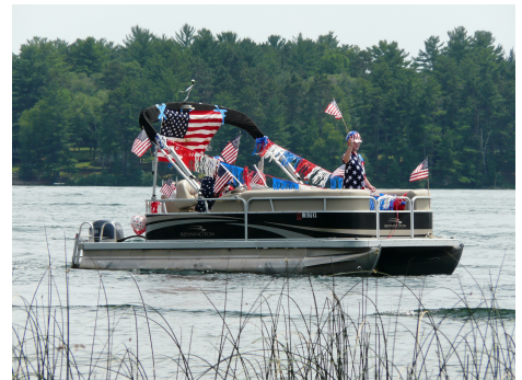
photo. Unfortunately, during the Lower Cullen parade a lone jet skier raced in and out of the boat lineup, endangering participants and intentionally kicking up spray on some of them.

Lower Cullen had a very respectable but not record setting turnout of 38 watercraft in the parade, including the traditional flag-carrying pair of waterskiers who made several rounds of the lake during the boats’ one time around. Ann Beaver provided this